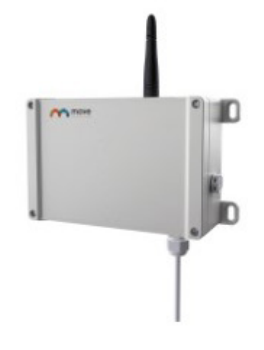
Digital Communication Node