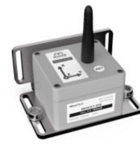
Wireless Accelerometer SHM

Contact your local sales representative to see how the combination of Trimble and Move Solutions sensors can help your projects!